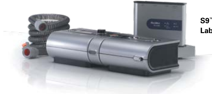
S9™ VPAP™ Tx Lab System